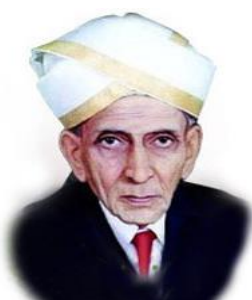
Sir M. Visvesvaraya

The Institution of Engineers (India), Jammu Local Centre congratulates all the engineers on the auspicious occasion of 163 rd birth anniversary of the greatest engineer of the soil Bharat Ratna Sir Mokshagundam Visvesvaraya . 15 th of September is celebrated as Engineers' Day all over the country as a mark of respect to Sir Mokshagundam Visvesvaraya who was born on this day in the year 1861.